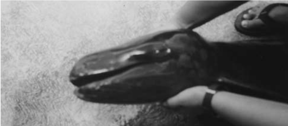
Figure 4. Close-up of view of head of juvenile false killer whale, Pseudorca crassidens , stranded in Saipan Lagoon, May 13, 2000.

On August 24, 1993 a dwarf sperm whale was found stranded at San Jose beach (Fig. 1). Personnel from the DFW recorded the following observations. The length from the tip of the snout to the origin of dorsal fin was 59 cm, and the length from the tip of snout to the fluke notch was recorded as 127 cm. The relative placement of the dorsal fin near or forward the midpoint of the back is characteristic of this species. The length of the individual indicated that it was a sub-adult. A tooth count was not obtained. An autopsy revealed no external wounds that appeared to be fatal, and the external surface was described as having extensive lacerations, presumably from coral rock (Fig. 5). The sex of the animal was listed as undetermined, although one staff documented that they observed possible ovaries.