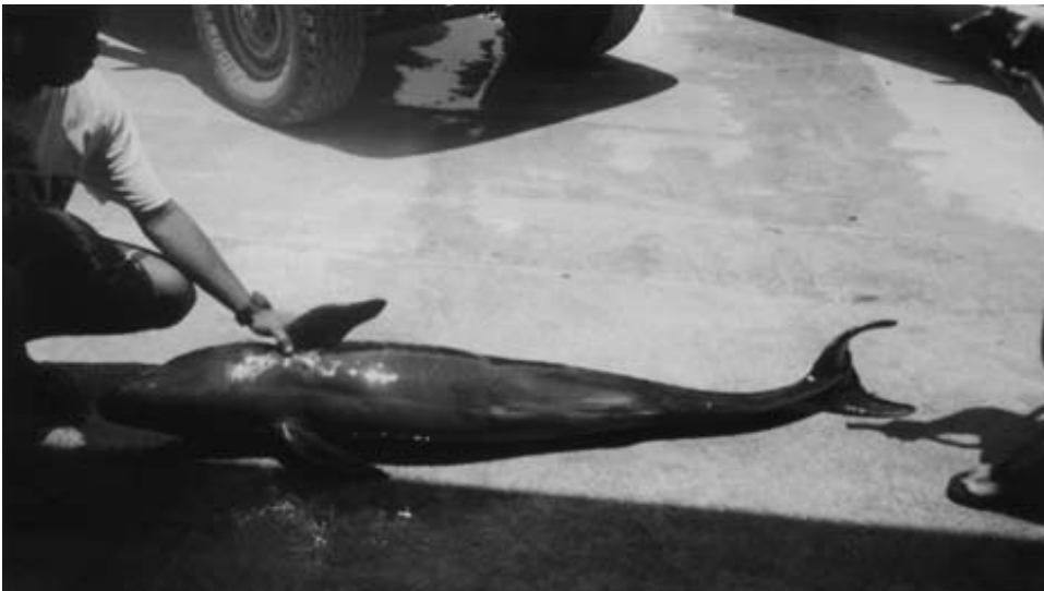
Figure 3. Carcass of juvenile false killer whale, Pseudorca crassidens , stranded in Saipan Lagoon, May 13, 2000.

the separation, as the juvenile was probably not a strong swimmer. As the whale was lifted out of the water into the transport boat it began making rapid clicking sounds. In the boat it squirmed excessively at first but calmed down after water was continually poured over it to keep it cool. About halfway toward the channel entrance the whale had expired, its blowhole closed tight. The whale was then brought back to the Fisheries warehouse in lower base for autopsy (Fig. 3). The tip of snout to fluke notch was 161.29 cm, tip of snout to dorsal fin insertion 73.66 cm, pectoral fin length 21.84 cm, blowhole width 3.81 cm, fluke width 30.48 cm, girth in front of dorsal 70.49 cm, fat layer below front of dorsal fin on belly 0.64 cm. Teeth were not emergent. Teeth 'ridges' under the gum were counted: mandible 9 left, 8 right, maxilla 8 left, 8 right. A shark bite impression was visible on the left fluke, although the fluke was not bleeding or broken. Numerous scrapes and cuts from snout (Fig. 4) to, and including the ventral thoracic region. Whale was identified as female by relative locations of anus and genital opening, and presence of mammary slits, and presence of uterus and ovarian tissue upon dissection. Internally, genital slit directed in anterior direction.