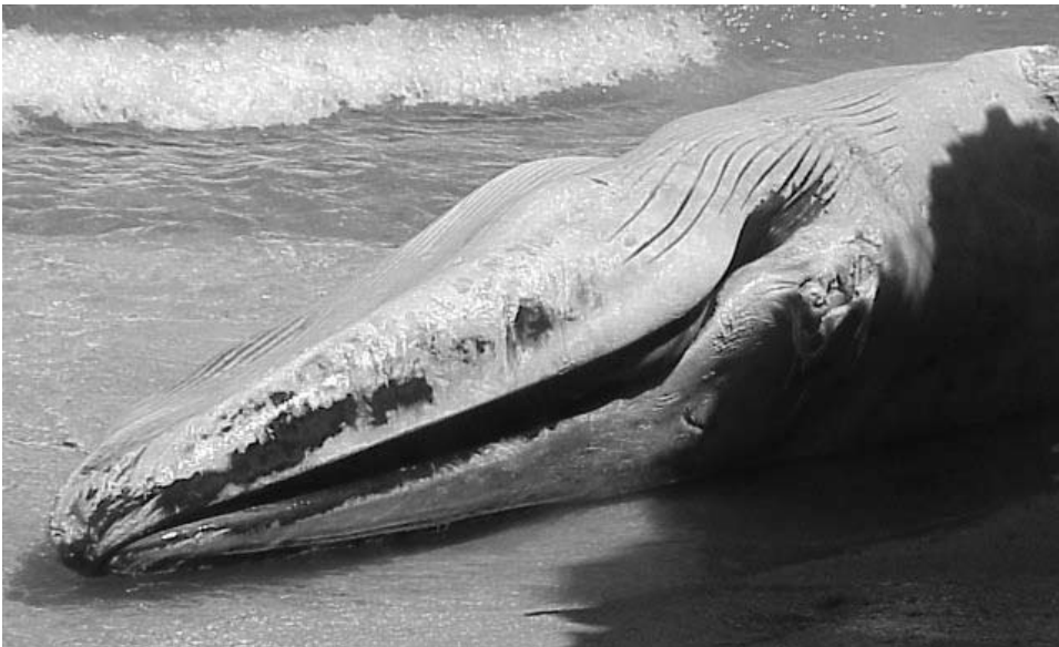
Figure 8. Anterior view of a stranded Byrdes Whale, Balaenoptera edeni , at Masalog Beach on February 16, 2005.

An unidentified baleen whale was reported from Barcinas Bay in Tinian in 1997. Anecdotal reports stated that the whale came ashore in a wounded condition accompanied by several tiger sharks ( Galeocerdo cuvier ) that were feeding on it. No additional information exists from this stranding.