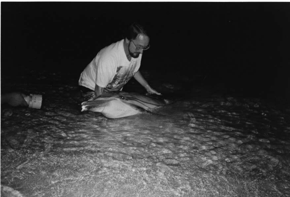
Figure 2. DFW Staff Biologist attending to a stranded striped dolphin, Stenella coeruleoalba , at Susupe Beach, Saipan, September 22, 1993.

A striped dolphin stranding was recorded in 1993 from the Susupe Beach area of Saipan Lagoon (Fig. 1). On the evening of September 22, 1993 at about 18:30 DFW staff biologists were called to Susupe Beach (Fig. 2). A striped dolphin ( Stenella coeruleoalba ) was observed swimming towards the beach, and after several attempts to re-direct the mammal, it finally swam into deeper water at 20:00 and disappeared from sight. Observations recorded the tip of the dolphins' lower jaw to have been split with several teeth on either side missing. No other injuries were observed. The following day a dead dolphin was reported and picked up at the San Jose beach in the morning. It was further determined that the dolphin had