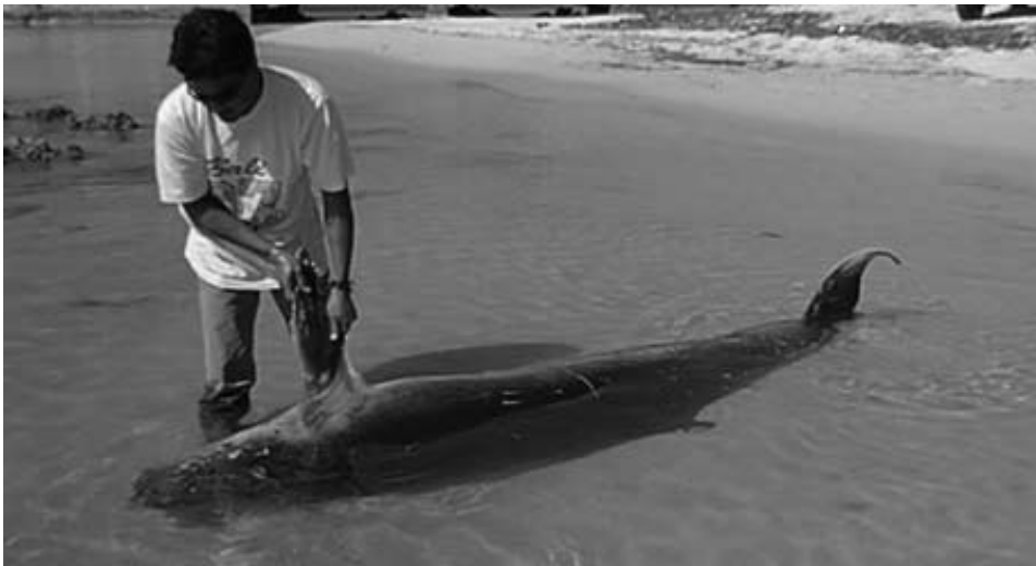
Figure 6. Carcass of pygmy sperm whale, Kogia breviceps , stranded at Sugar Dock in Saipan Lagoon on December 4, 1997.