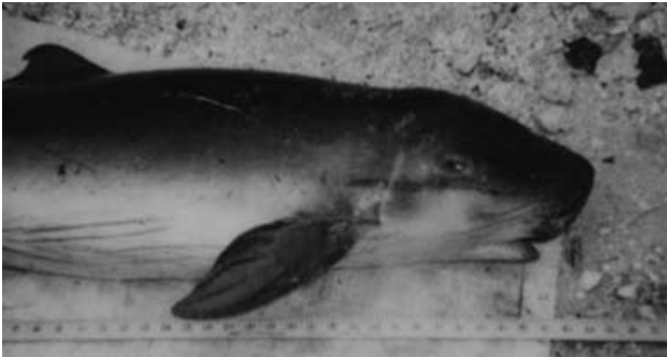
Figure 5. View of anterior portion of stranded dwarf sperm whale, Kogia simus , from San Jose Beach on August 24, 1993

On August 24, 1993 a dwarf sperm whale was found stranded at San Jose beach (Fig. 1). Personnel from the DFW recorded the following observations. The length from the tip of the snout to the origin of dorsal fin was 59 cm, and the length from the tip of snout to the fluke notch was recorded as 127 cm. The relative placement of the dorsal fin near or forward the midpoint of the back is characteristic of this species. The length of the individual indicated that it was a sub-adult. A tooth count was not obtained. An autopsy revealed no external wounds that appeared to be fatal, and the external surface was described as having extensive lacerations, presumably from coral rock (Fig. 5). The sex of the animal was listed as undetermined, although one staff documented that they observed possible ovaries.