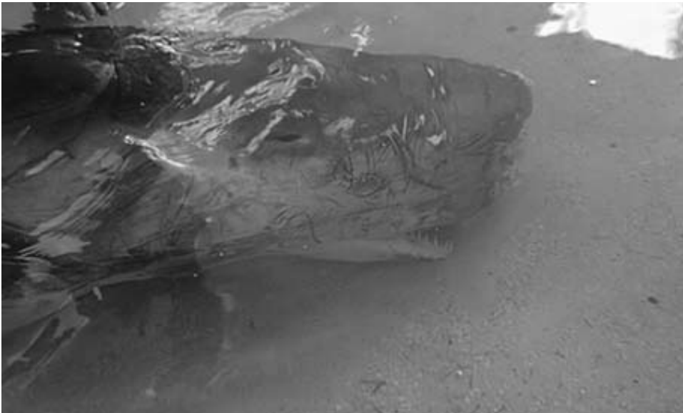
Figure 7. Close up of head of pygmy sperm whale, Kogia breviceps , stranded at Sugar Dock in Saipan Lagoon on December 4, 1997, showing severe lacerations.

the mouth line, which was identified as a scar from a cookie cutter shark, Isistius brasiliensis . The length of the specimen from the tip of the snout to the fluke notch was recorded as 2.78 m. The girth of the specimen immediately in front of the dorsal fin was recorded as 1.01 m. The dorsal fin was falcate, low in height and more than 60% along the dorsal surface. The tooth count was 0/14 both sides, and no damage to the teeth was observed. The stomach was observed to be empty with intestines containing some digested material that was not sampled. The specimen was identified as a mature male by the presence of mature gonads, penis, as well as body length. No apparent internal abnormalities were observed. The lower jaw was excised, cleaned and dried by DFW and subsequently sent to the U.S. National Marine Fisheries Services' Southwest Fisheries Science Center in La Jolla, CA.